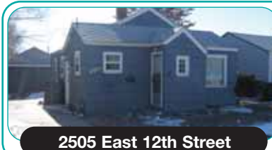
2505 East 12th Street

First time home buyers, hurry, hurry! Fantastic location on a quiet street. Very comfortable floor plan, 2 baths, large living room, perfect for your big screen TV. Bright eat-in kitchen, newer furnace and water heater, storage everywhere with an attached garage. *133,500. #44071