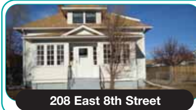
208 East 8th Street

Need 4 bedrooms together for your family? This lovely 2-story has 4 large bedrooms on upper level. Main level has formal living and dining rooms plus main floor family room, powder room, laundry room and walk-in pantry. Quiet cul-de-sac location within walking distance to Sunrise School and park. *235,900. #44025