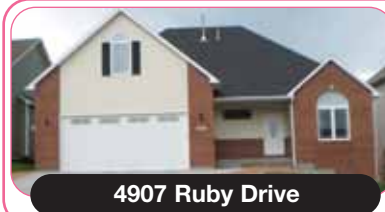
4907 Ruby Drive

Remodeled north townhouse , 3 bedrooms, 3 baths, 2-car garage. End unit close to Central High School. New paint, new carpet, new interior doors. Remodeled baths and kitchen. Patio/deck over garage, maintenance-free steel siding and brick exterior. *139,900. #44016