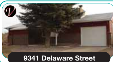
9341 Delaware Street

Very affordable starter home! Single family home, has 4 bedrooms, 2 baths with a fenced backyard. This is a great investment property 3-plex, duplex or single family house with separate studio for family. *119,900. #43776