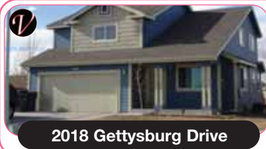
2018 Gettysburg Drive

Need 4 bedrooms together for your family? This lovely 2-story has 4 large bedrooms on upper level. Main level has formal living and dining rooms plus main floor family room, powder room, laundry room and walk-in pantry. Quiet cul-de-sac location within walking distance to Sunrise School and park. *235,900. #44025