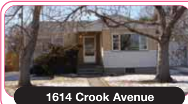
1614 Crook Avenue

Better than new! All the upgrades you could want: Schroll oak cabinets, central A/C, sprinkler system, sod & landscaping rock in front & back, maintenance-free exterior including brick & metal siding, upgraded roof, spray foam insulation, 9' basement ceilings, garage door opener, stainless steel appliances, jetted tub in master bath, huge vaulted ceiling, 13'x21' bonus room. *289,999. #43790