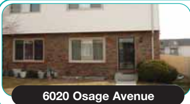
6020 Osage Avenue

Vintage 2-story home with new carpet, vinyl and paint. Four bedrooms, 2 baths and 1-car garage. Some original woodwork and leaded windows in living room and dining room. *119,900. #43818