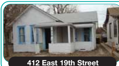
412 East 19th Street

Awesom 5 bedroom, 3 bath , 2-story home located on 5 of the most scenic acres in Wyoming, including rock outcroppings and trees. This is the builder's own home, with aspen railings, wood trim, foam insulation, Hardie board siding and many more upgrades. *428,000. #43877