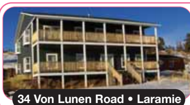
34 Von Lunen Road • Laramie

Great 1920's 2-story located on Main Street in Burns, WY. Great curb appeal. Some new vinyl windows. Beechwood hardwood floors. Four bedrooms and formal dining room. Double garage with RV garage behind it. Large 10,875 sq. ft. loft. *101,900. #43757