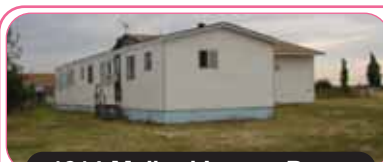
1014 Mallard Lane • Burns

Room to roam! 9.55 Fenced acres with 3 bedrooms, 2 baths, 2-car attached garage. Lots of potential!