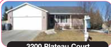
3200 Plateau Court

Wow! Ranch-style home in Crest Ridge, 5 bedrooms, 3 baths, 2-car attached garage, well maintained & clean. Hardwood floors, fireplace, master bath, central A/C, sprinkler system, maintenance-free Trex deck, utility shed & landscaping in front & back. Basement is finished with family room 17'x30', 2 bedrooms & bath.