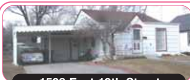
1508 East 19th Street

A sweetheart of a home! You won't want to leave! Clean and so well cared for. Four bedrooms, 2 baths, 2-car carport plus finished 1-car attached garage, formal dining plus eat-in kitchen. Workshop and covered patio in back. Tiered rock and flower gardens!