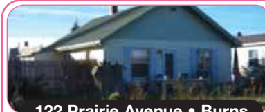
122 Prairie Avenue • Burns

Looking for a big yard for kids to play in? Quiet are in Burns, 2 bedrooms, 1 bath, formal dining room and main floor laundry. Ranch-style home with garage and unfinished basement.