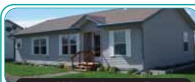
306 Abilene Loop • Burns

Peace and quiet! Enjoy living in the small town of Burns. Nearly new 3 bedroom, 2 bath, 1 level home in excellent condition! Lovely oak cabinetry throughout! Formal dining plus breakfast room, large kitchen w/pantry. Lush lawn w/sprinkler system! Located on the edge of town.