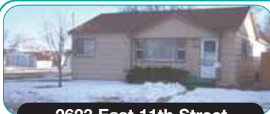
2623 East 11th Street

Cute 2 bedroom, 1 bath house with large living room and family room, all on 1 level. New windows, Schroll cabinets and remodeled bath. On a corner lot.