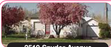
2510 Snyder Avenue

Cute and cozy 2 bedroom, 1 bath home, close to downtown. Fenced backyard. All appliances included.