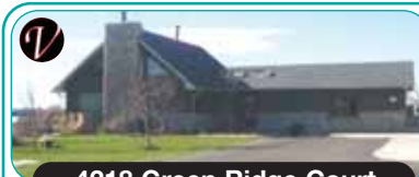
4218 Green Ridge Court

Custom home w/spectacular features! Just east of the city limits, close to everything! Upgraded w/stone tile throughout in kitchen & baths. Two enormous family rooms, 1 on main floor. Main floor laundry, 5 bedrooms & 3 baths. 32'x32' Garage/shop, 1.83 acres that allows horses. Sprinkler system & lush landscaping in front.