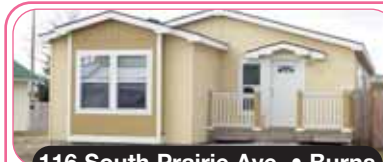
116 South Prairie Ave. • Burns

Absolutely perfect, 3 bedroom, 2 bath home, only 5 years old and located in the friendly community of Burns. All 1 level living with nice open floor plan and large bedrooms. Nice sized lot, new storage shed and privacy fenced backyard.