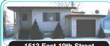
1513 East 19th Street

"Feel the quality" in this well cared for 4 bedroom, 2 full bath home. Garden level basement. Laundry room on the main level and basement as well! Two full kitchens, covered patio, vinyl siding, off-street parking in front and back. Unbelievable storage.