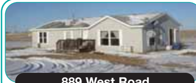
889 West Road

Goodbye to city limits. Spread out on 4.59 acres. A cook's delight kitchen opens to a huge dining room and living room. All 3 bedrooms are big too! Easy access barely off pavement. Vinyl siding on this 1,680 sq. ft. home.