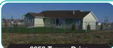
6656 Troyer Drive

Looking for an awesome view? This is it! A great 3,200 sq. ft. total. Finished basement, 5-car garage, 2-car attached heated garage/workshop! Four bedrooms, 3 baths, open floor plan. Built in 2006.