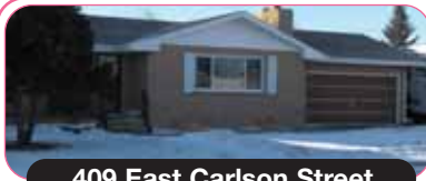
409 East Carlson Street

Maintenance-free, new windows, all brick exterior. Large 2-car attached garage. Finished basement. Built in 1961, great street appeal. Oodles of parking in front and rear. Close to schools.