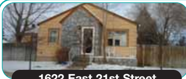
1622 East 21st Street

Centrally located property is on corner lot and has spacious family room, living room with hardwood floors. Please call on zoning requirements.